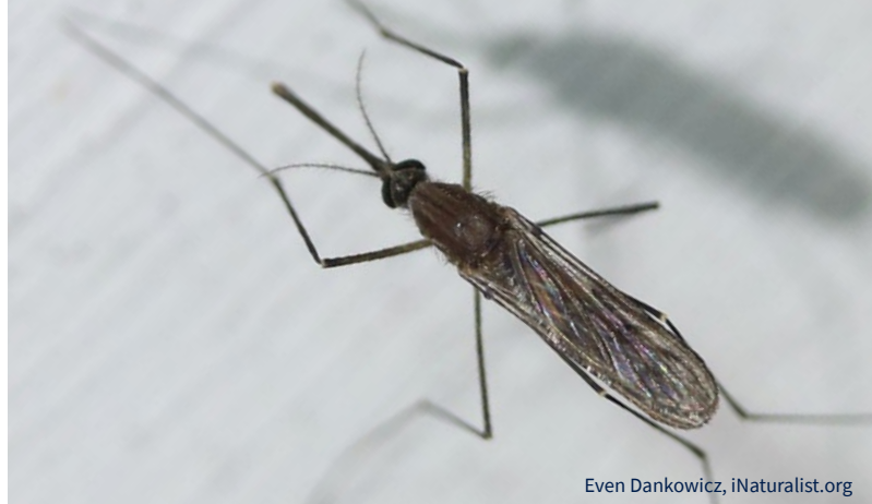
Even Dankowicz, iNaturalist.org

The common malaria mosquito ( Anopheles quadrimaculatus ) is actually a group of five species that are genetically different but look so much alike that it is difficult to tell them apart under a microscope. These mosquitoes are present in the eastern United States up into southeastern Canada, but are more prolific in the southeastern states, especially along the Gulf of Mexico. They are the main vector of malaria in North America. Although malaria outbreaks have not happened in the United States since the 1950s, local transmission does occur sometimes.