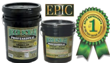
Deer Scram Professional #783152