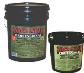
Snake Scram Professional #795970/795975

EPIC's All Natural Professional animal repellents offer pest-control companies unique opportunities to add sales to current programs and open new channels of revenue through building new customers with products that work.