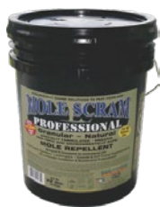
Mole Scram Professional #783154

EPIC's All Natural Professional line of granular animal repellents was developed to serve this expanding need. Deer Scram, Snake Scram and Mole Scram and our other professional animal repellents are specifically designed to target these pests' instincts and senses through smell and taste, while also making their living habitat unlivable.