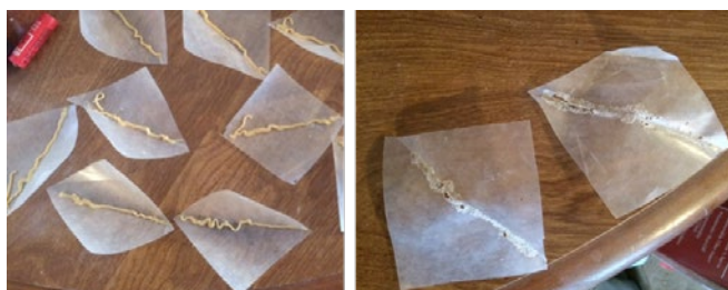
Left: wax paper applied with Advion Evolution. Right: German cockroaches consumed Advion Evolution and ate through the wax paper.